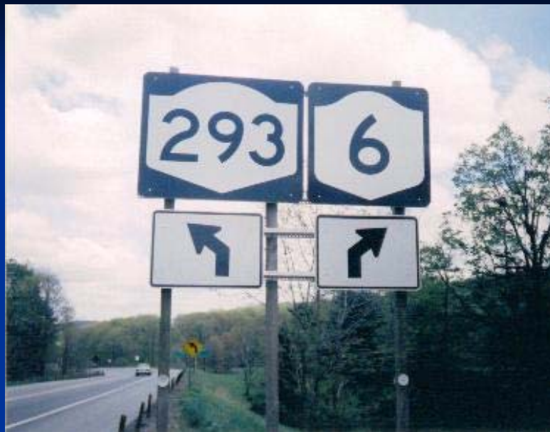
Not always signed correctly ("6" should have a US Route shield) – and Road Enthusiasts find the errors.